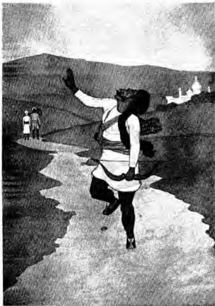
Weak-sight awaiting the fall of his arrow.